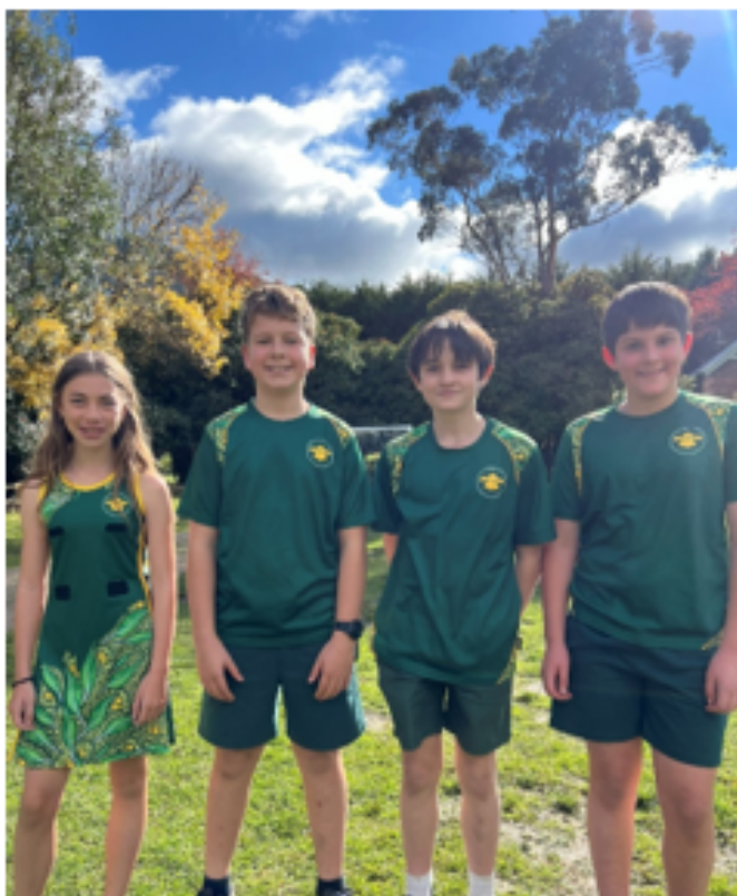
Our Sport Captains modelling our new sport uniform: